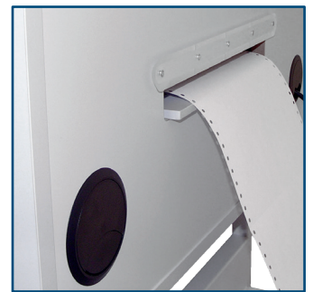
Rear side with tear-off bar