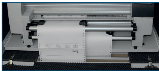
Two separate paper slots (Photo shows PP 809 into the Sound Cover)