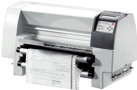
PP 803 / PP 803C with integrated paper cutter

The PP 803 printer offers a professional solution for heavy duty, flexible, cost-efficient printing. The rugged metal design, the paper run control, and the ribbon run control guarantee reliable unattended printing. With its proven connectivity concept the printer is prepared for any network environment.