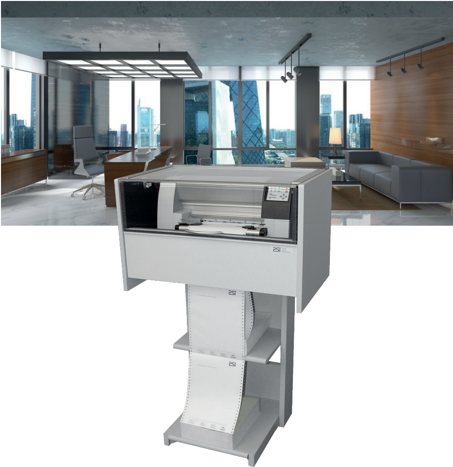
PP 803 with Sound Cover S/SC 05 mounted on printer stand

The new Sound Cover S/SC 05 combined with the the pedestal is the professional solution for maximum printing performance at minimal level of noise emission for the application of the compact high speed printer PP 803 and PP 803C.