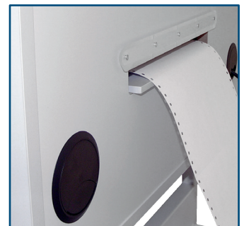
Rear side with tear-off bar