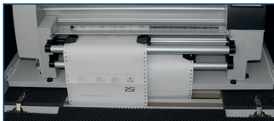
Two separate paper slots (Photo shows PP 809 into the Sound Cover)